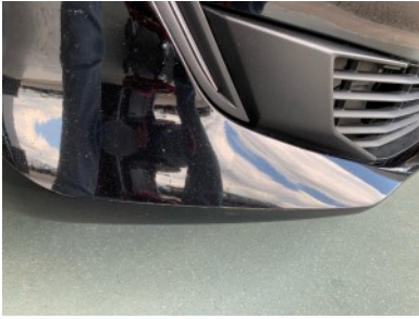
Front bumper - Scratch