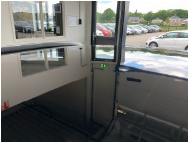
Roof - Restyle dent