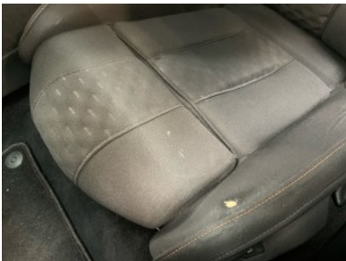
Gat in bestuurdersstoel