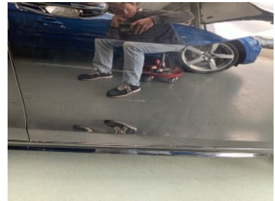
Front left door - Scratch