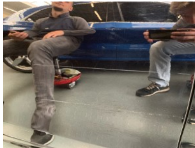
Rear right door - Scratch