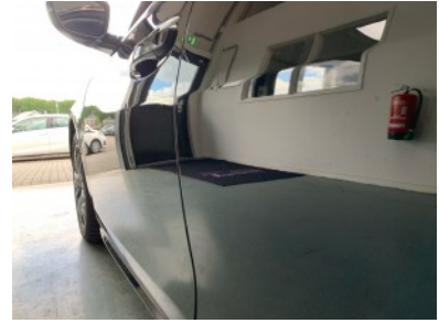
Rear left door - Restyle dent